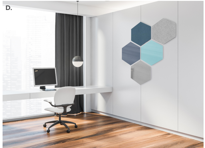
D. Hex shown in Glass, Acoustic, and Fabric Wrapped options