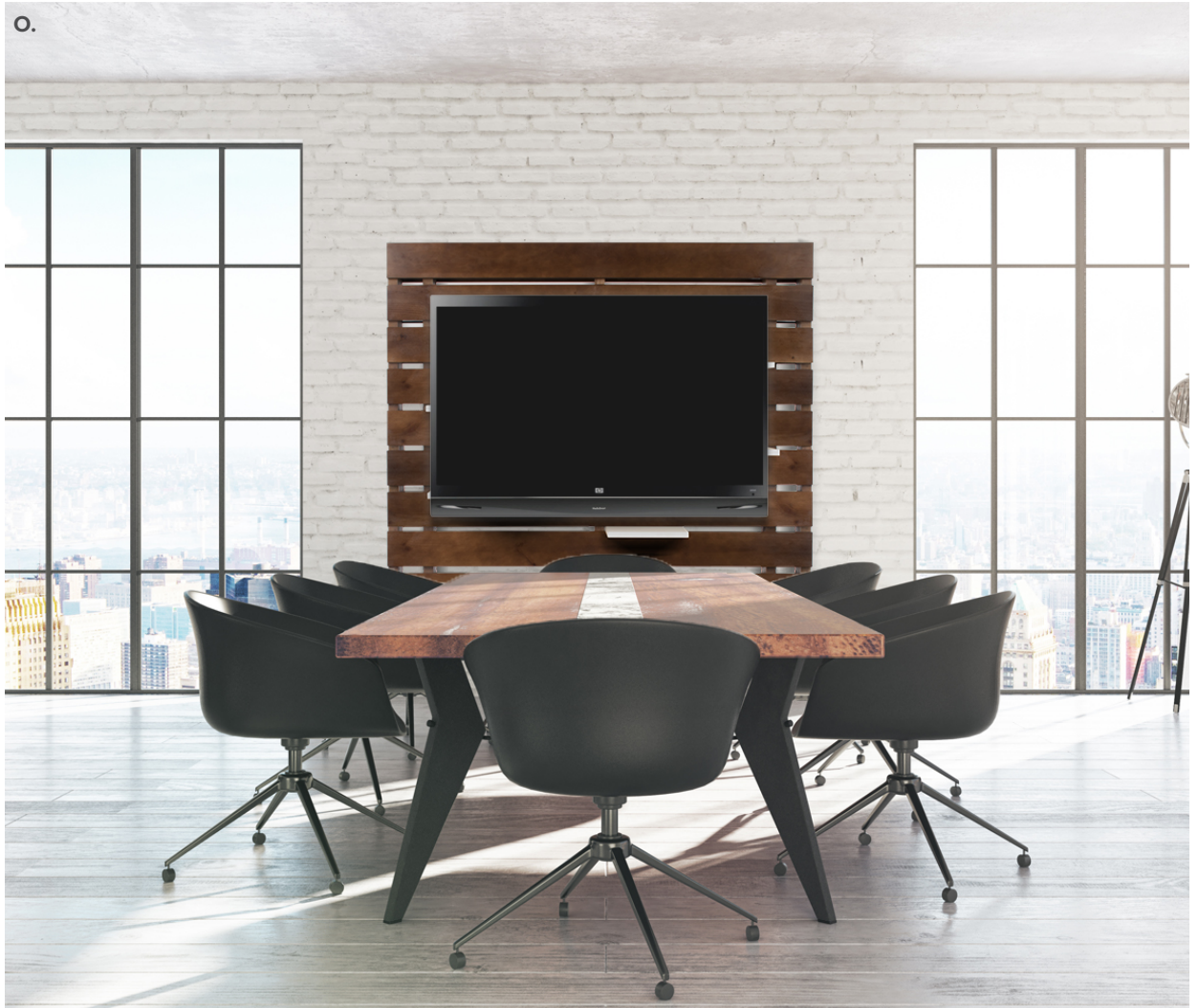
O. Pallet Wall shown in Modern Cherry finish