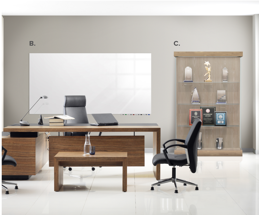
C. Vantage Display Case shown in Beigewood Laminate