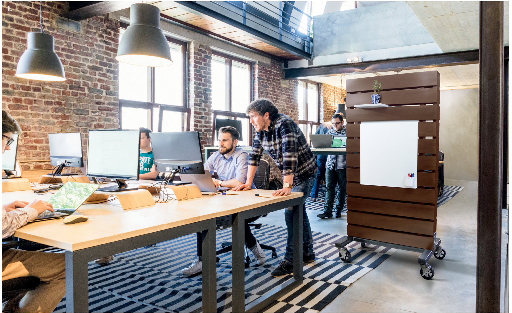
I. Pallet Mobile shown in Urban Walnut finish