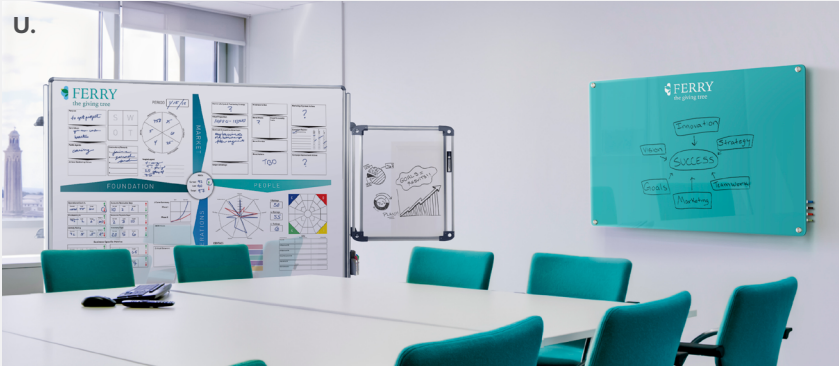
U. Custom (left) Nexus Easel and (right) Harmony Glassboard