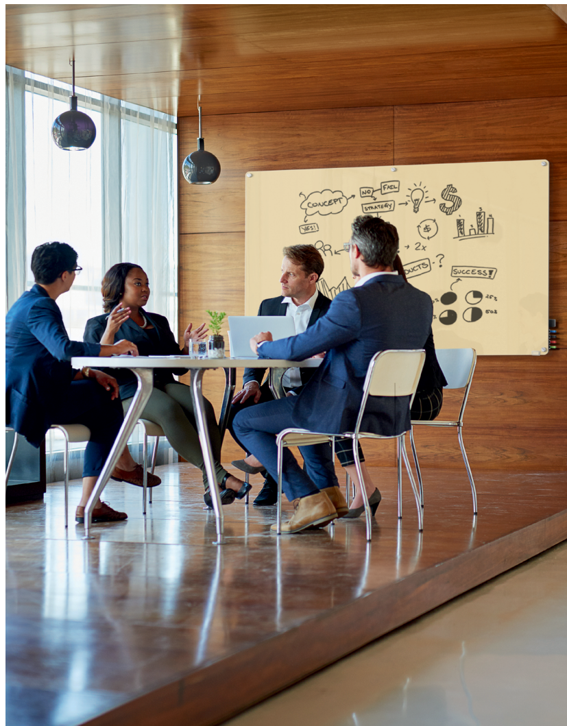
Pictured: Harmony Glassboard in Beige