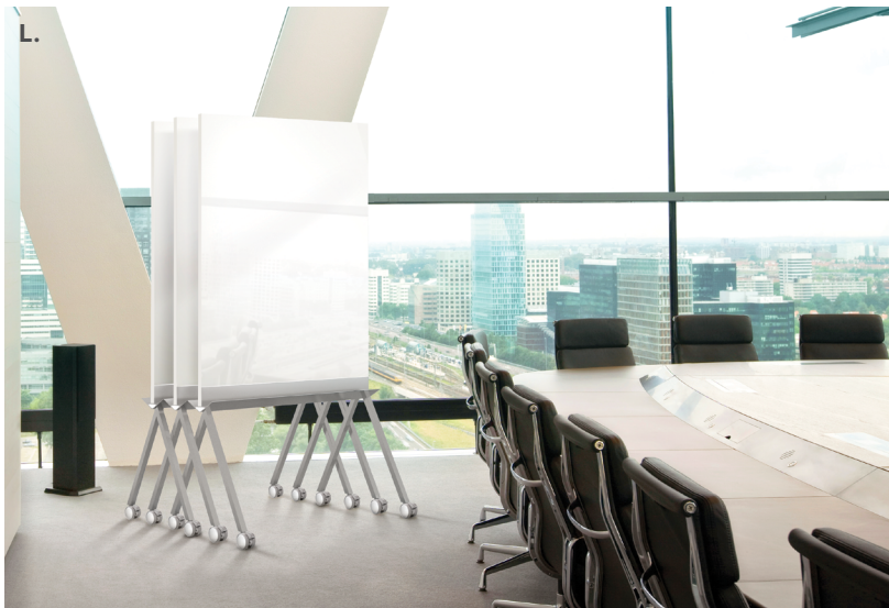
L. Roam Mobile Whiteboard