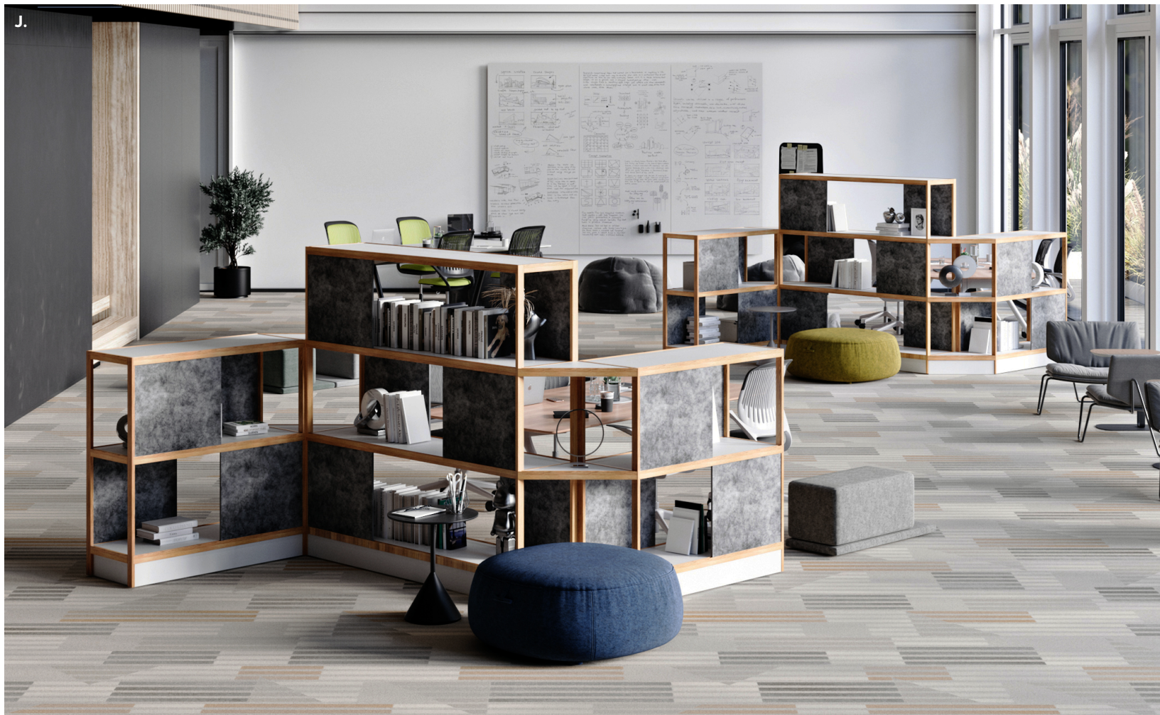
J. Control Shelving Units shown in Natural Stain, White Laminate, and optional Ash PET Panels