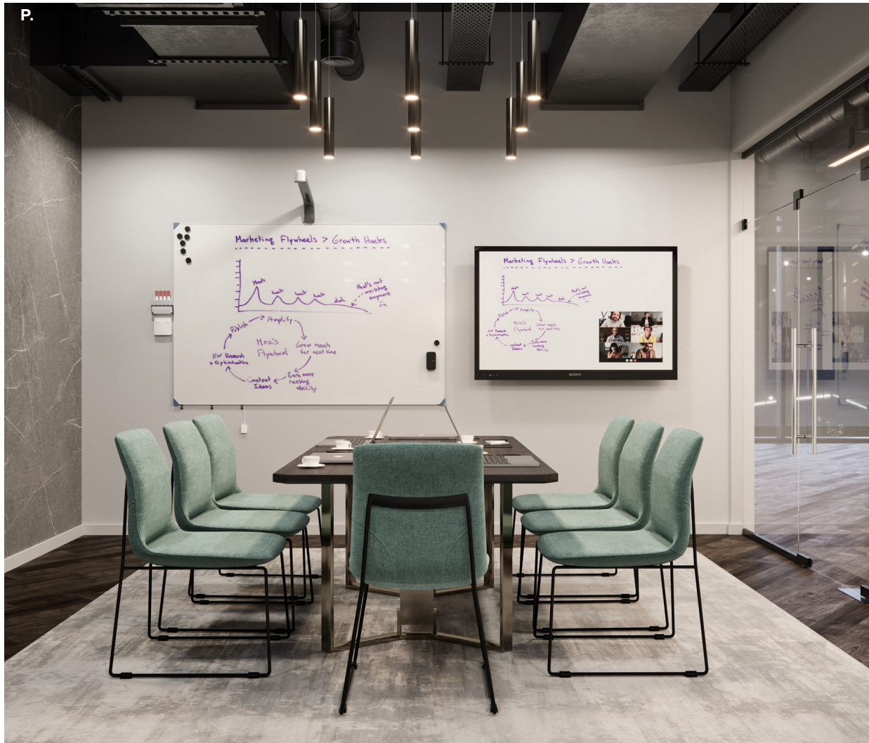
P. Aria Connect Glassboard with Image Capture Camera