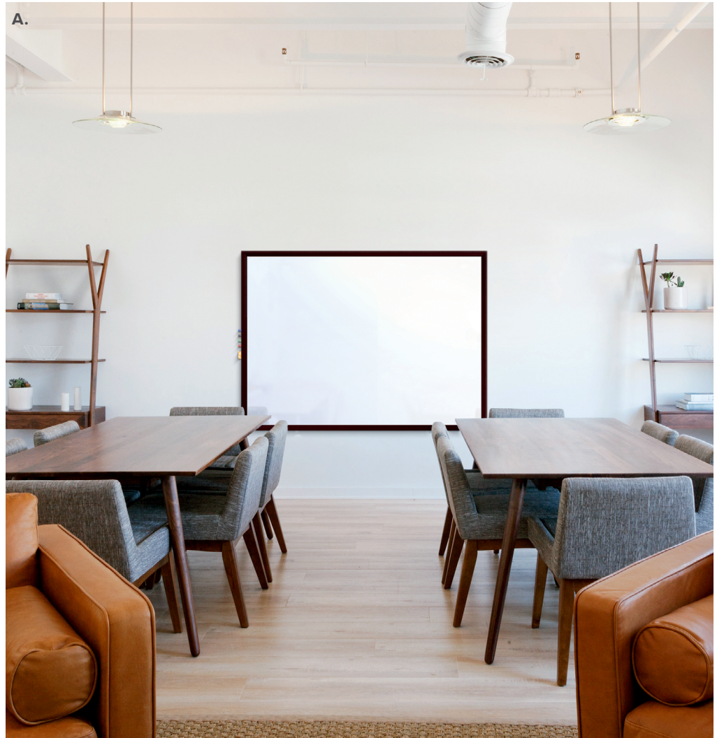
A. 4' x 5' Impression Whiteboard shown with a Modern frame and in Espresso finish