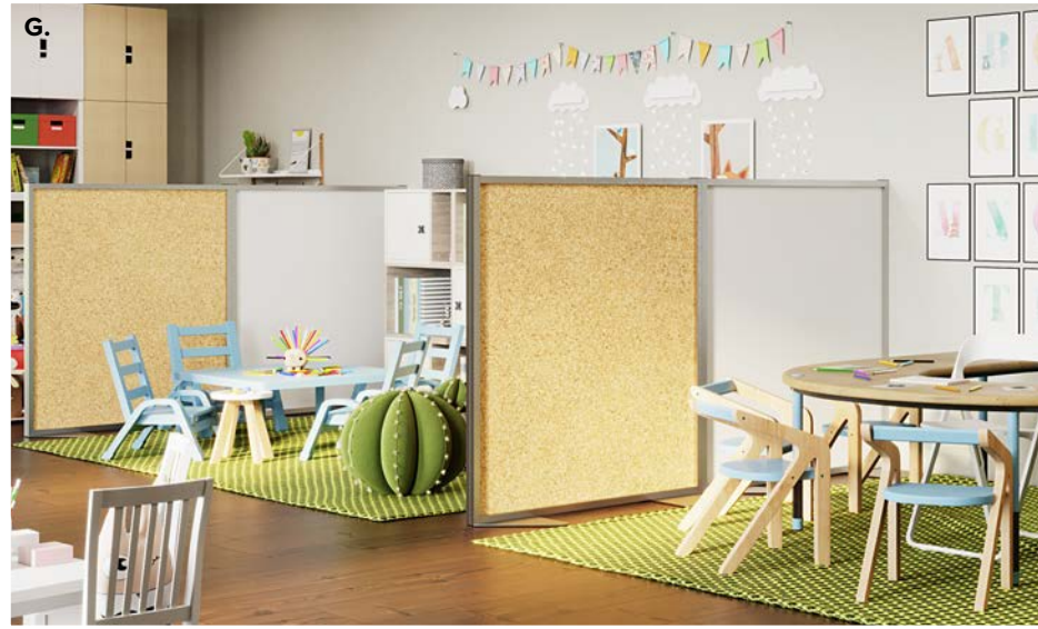
G. 54" H x 36" W Floor Partition in Natural Cork and Magnetic Porcelain Whiteboard