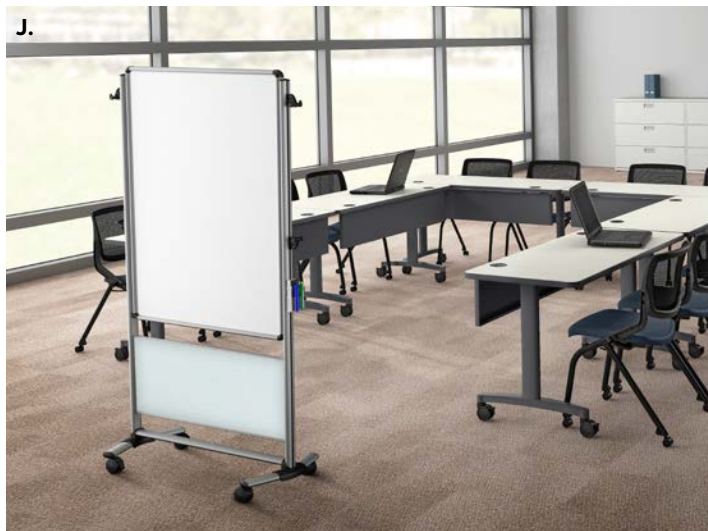
J. Nexus Easel