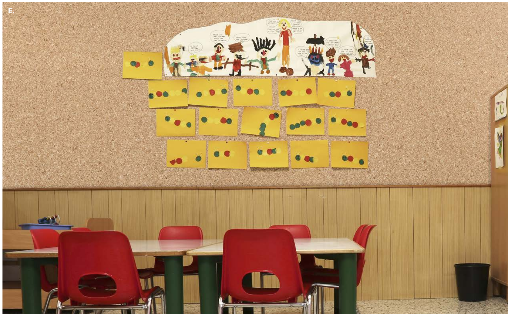
E. Cork wall using Rolled Cork