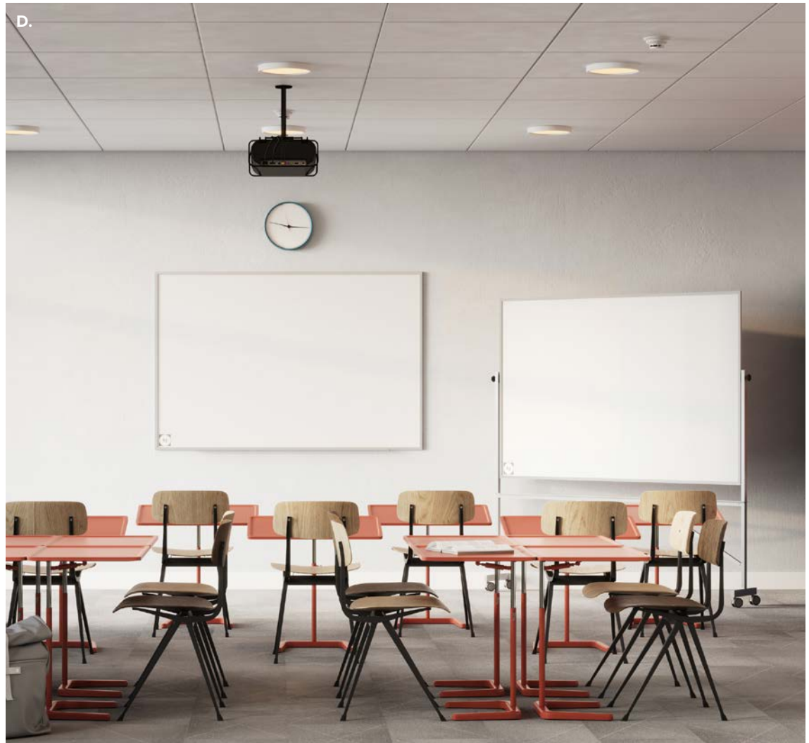
D. Hygienic Porcelain (M4) Whiteboard and Mobile