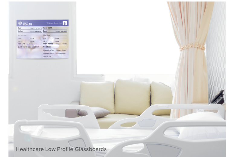
Healthcare Low Profile Glassboards