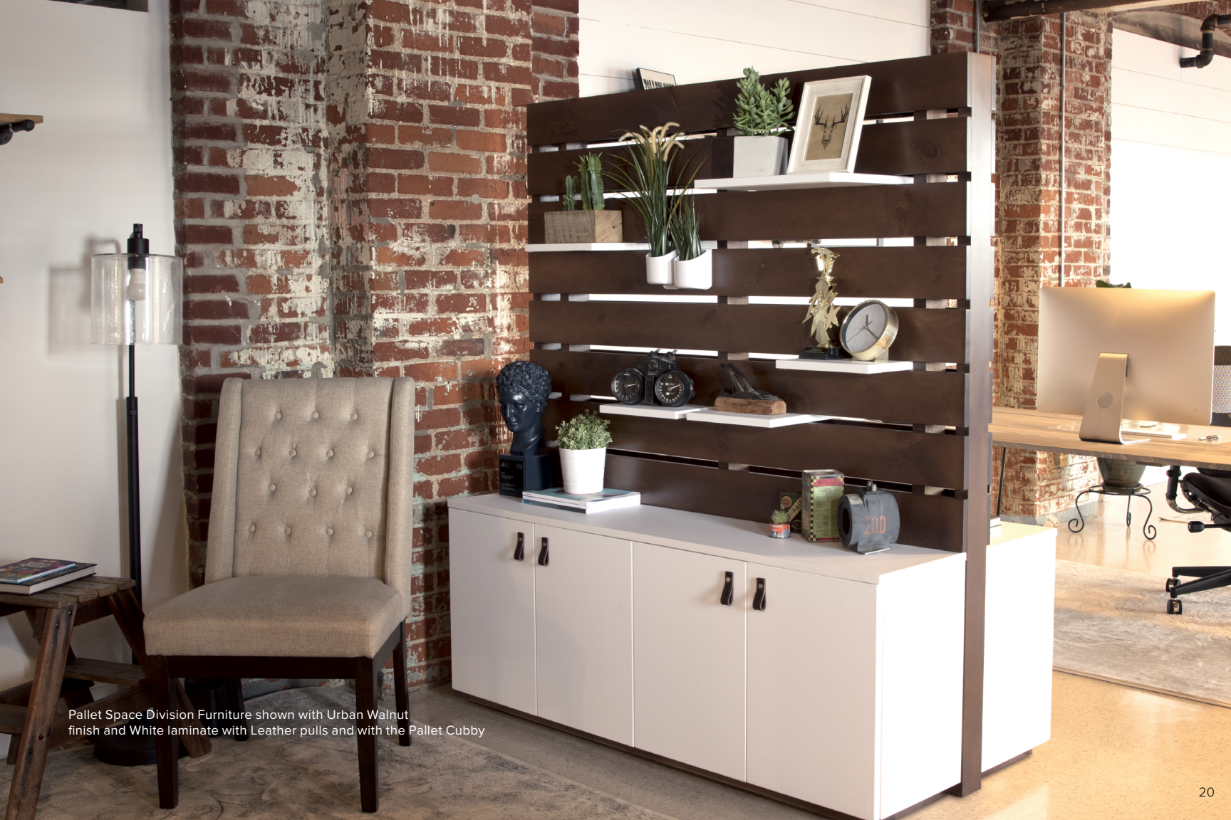
Pallet Space Division Furniture shown with Urban Walnut finish and White laminate with Leather pulls and with the Pallet Cubby