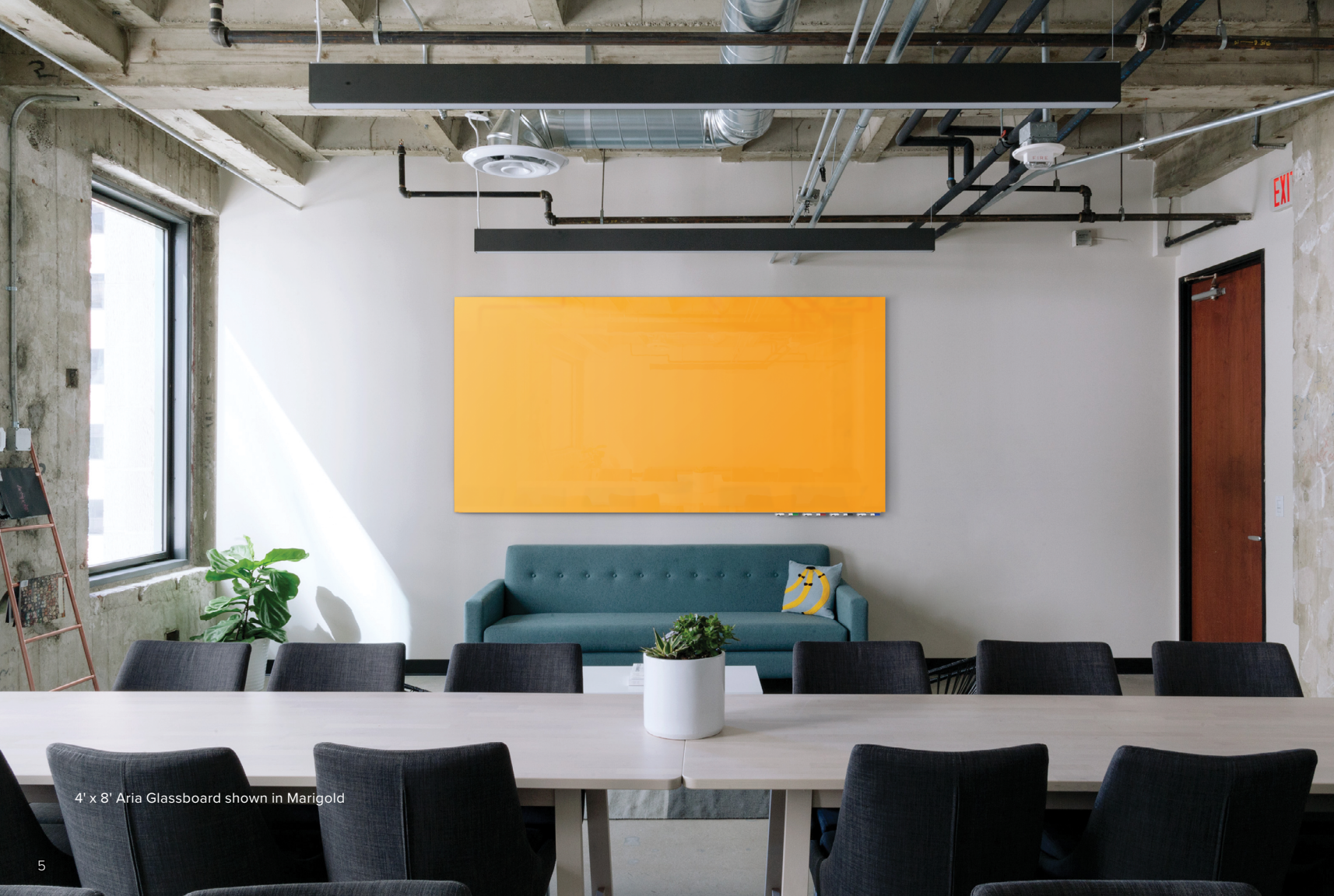
4' x 8' Aria Glassboard shown in Marigold