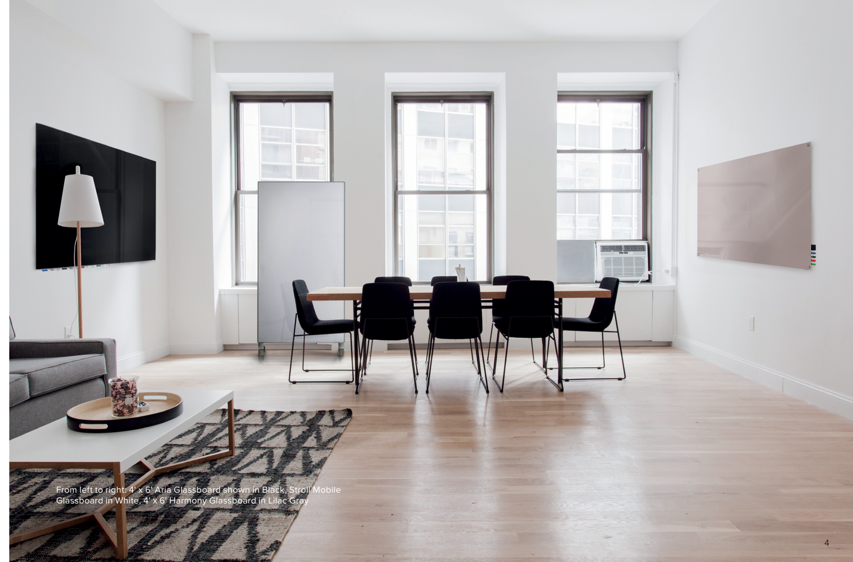
From left to right: 4' x 6' Aria Glassboard shown in Black, Stroll Mobile Glassboard in White, 4' x 6' Harmony Glassboard in Lilac Gray

Ghent's glassboards demonstrate the path to innovation in design. Whether it be our low profile Aria Glassboard or Harmony Glassboard, we are confident that you will find the glass whiteboard that is right for you. The sleek, customizable surface provides a balance between form and function while offering additional customization options like color matching, logo application, size, and configurations. Aria and Harmony Glassboards carry a 50-year warranty and exceed BIFMA standards, guaranteeing your board will never ghost or stain.