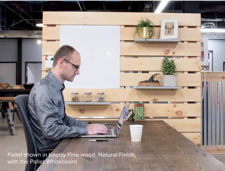
Pallet shown in Knotty Pine wood, Natural Finish, with the Pallet Whiteboard

With over 130 years of experience, The Waddell Display Collection embodies quality and value when it comes to furniture and displays, ensuring our products are built to last. Reinventing the display case with Pallet Space Division Furniture, Ghent continues to evolve by producing functional displays that divide space and bring function and style to open, traditional, or modern environments.