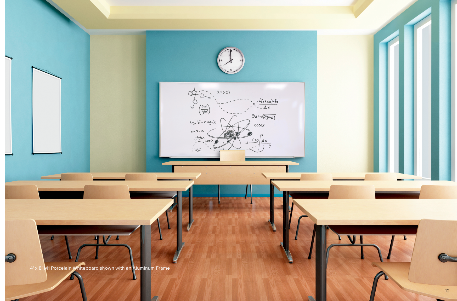
4' x 8' M1 Porcelain Whiteboard shown with an Aluminum Frame

There's something to be said about sharing ideas on a traditional whiteboard. At Ghent, we consider this to be important, and we've crafted our whiteboard product line to reflect these traditional nuances, while adding a modern edge to our designs. Whether its our unique surface options, or our carefully selected frame materials, we make sure our customers can enjoy the classic whiteboard look with a distinctly modern feel.