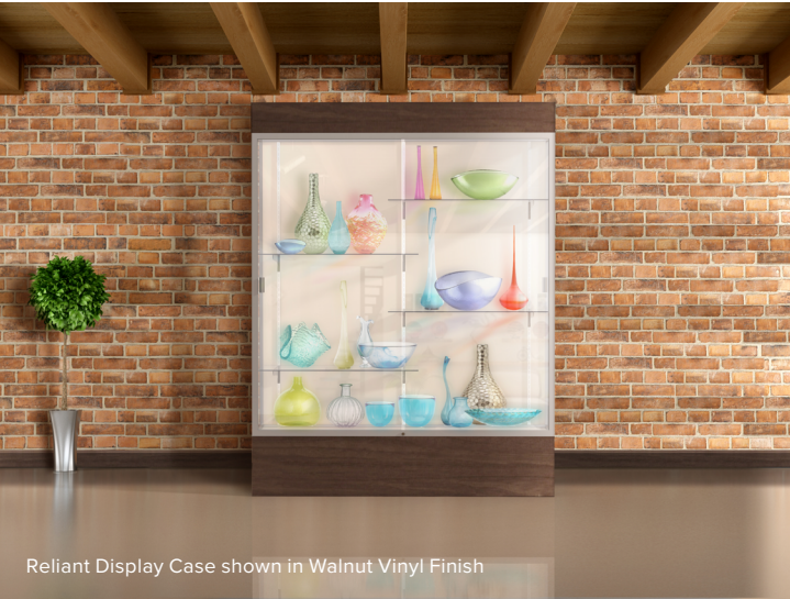
Reliant Display Case shown in Walnut Vinyl Finish