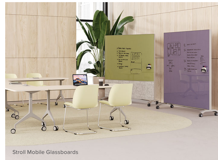
Stroll Mobile Glassboards

Ghent's extensive line of mobile whiteboards allow for brainstorming and collaboration when wall space is limited. Designed to be simple, clean, and functional, mobile whiteboards offer double-sided writing surfaces with integrated marker storage. They're also designed with the ability to nest multiple units to maximize space, and complement whiteboards on the wall for a complete design.