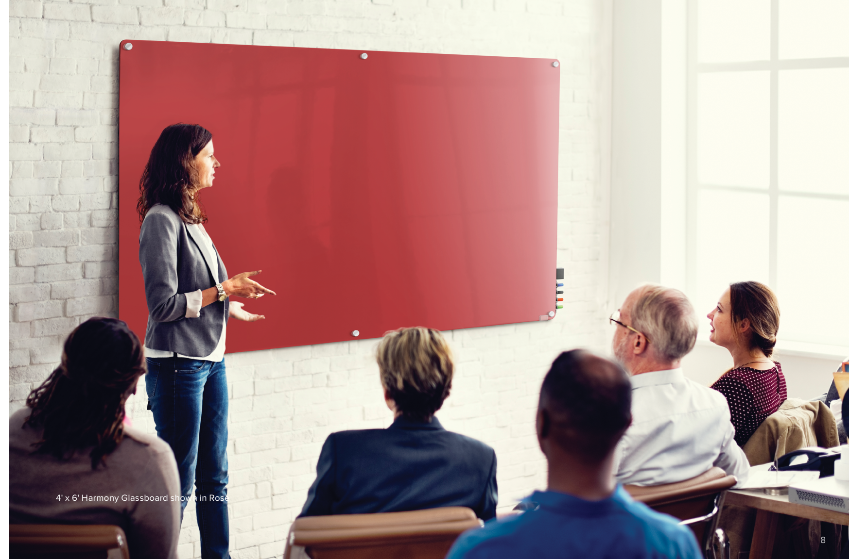
4' x 6' Harmony Glassboard shown in Rose

In our experience, the magic is in the details, and we know that's where great ideas can truly shine. Harmony Glassboards are made with this in mind, featuring square and round corner options that are paired with minimally exposed hardware. Sitting 1 1/4 inches off the wall, the shadowing and space provide depth and dimension that complements the modern aesthetic found in offices and workplaces—beautifully embellishing the content being shared.