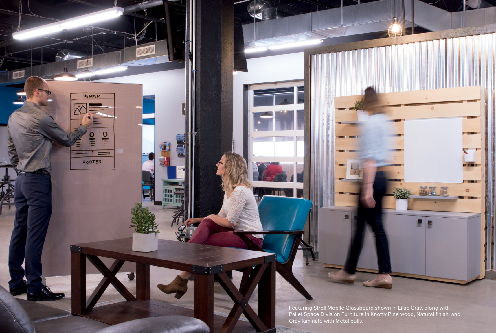
Featuring Stroll Mobile Glassboard shown in Lilac Gray, along with Pallet Space Division Furniture in Knotty Pine wood, Natural finish, and Gray laminate with Metal pulls.