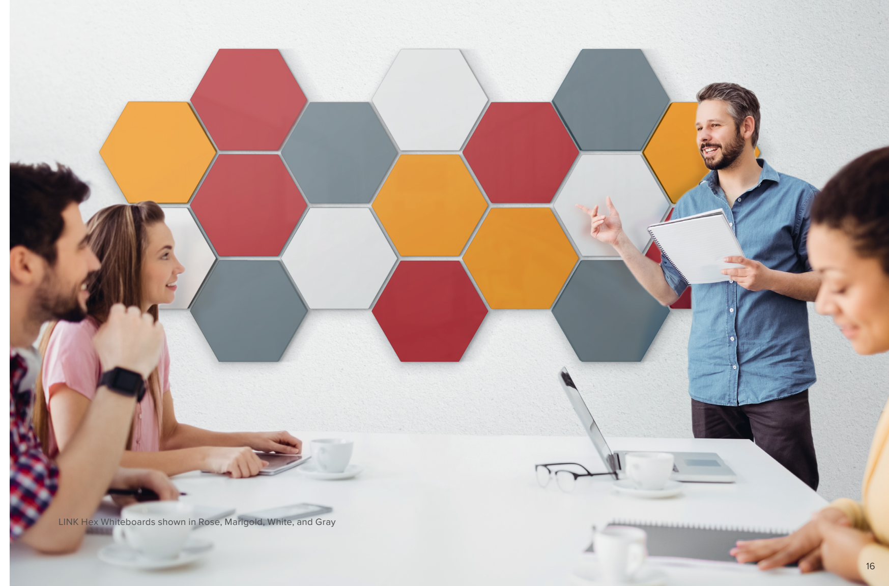
LINK Hex Whiteboards shown in Rose, Marigold, White, and Gray

Designed to make common areas uncommon, Hex whiteboards and bulletin boards combine an exciting shape with a variety of surfaces to leverage modern workspaces. Hex combines today's needs for beautiful and unique spaces with materiality to dampen noise, post company news, and communicate. Available in 4 different surfaces: LINK Powder-Coated Steel, Glass, Acoustic Panel, and Wrapped Fabric, giving endless possibilities to mix and match to your choosing.