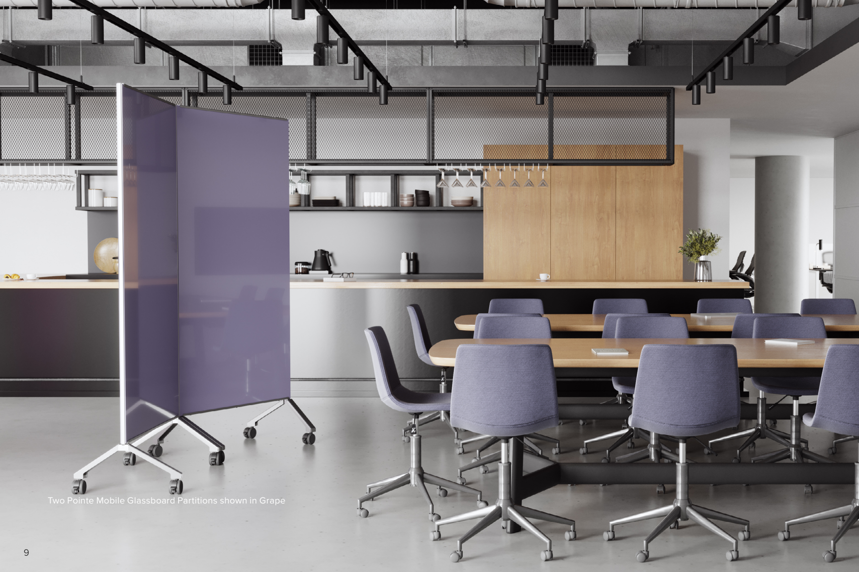
Two Pointe Mobile Glassboard Partitions shown in Grape