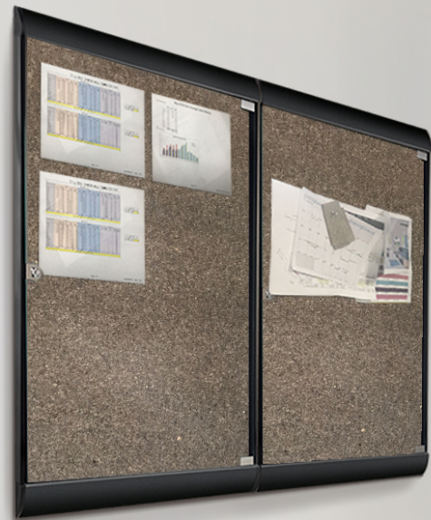
Silhouette with Black frame shown in Chocolate Cork