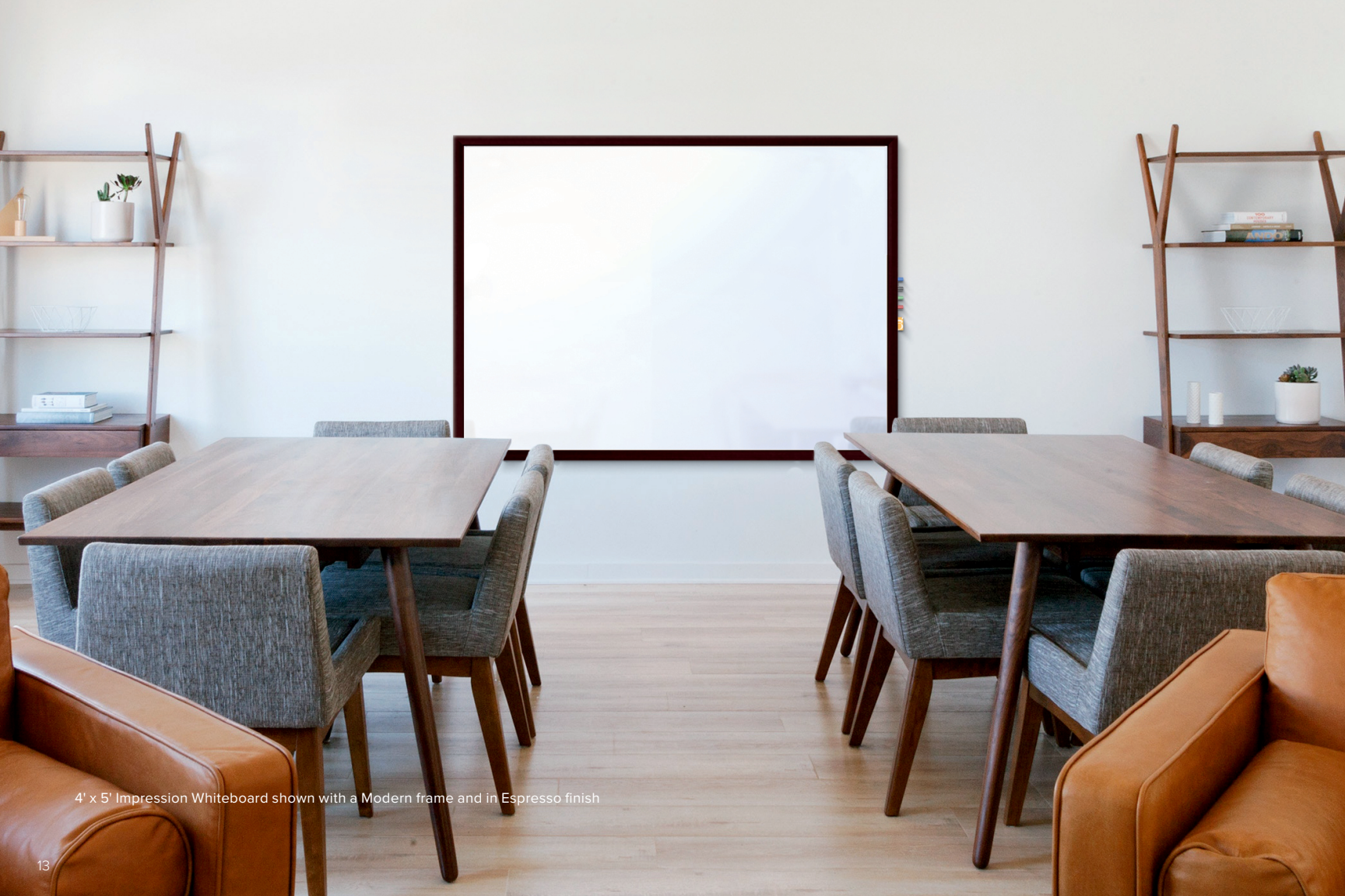
4' x 5' Impression Whiteboard shown with a Modern frame and in Espresso finish