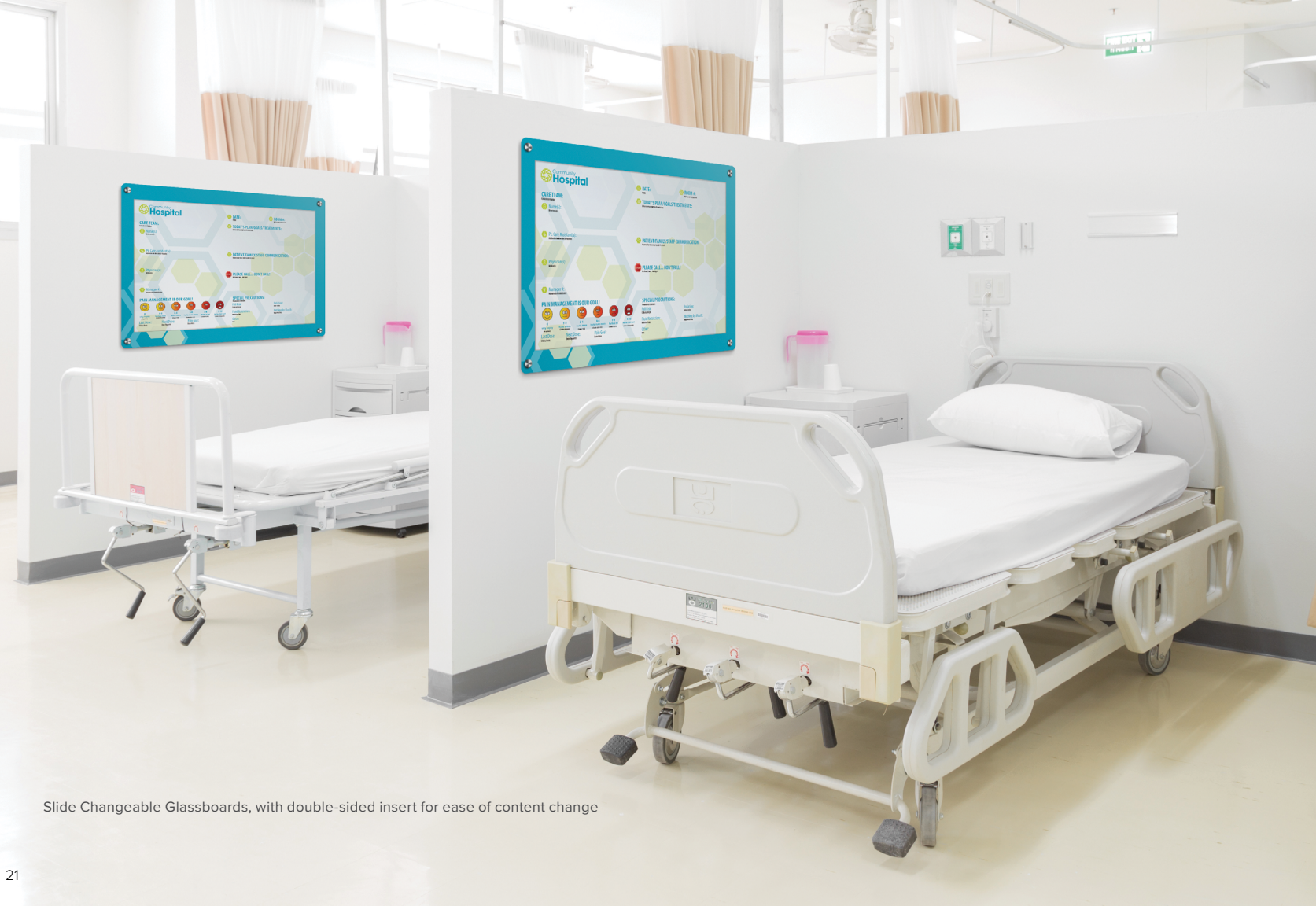
Slide Changeable Glassboards, with double-sided insert for ease of content change